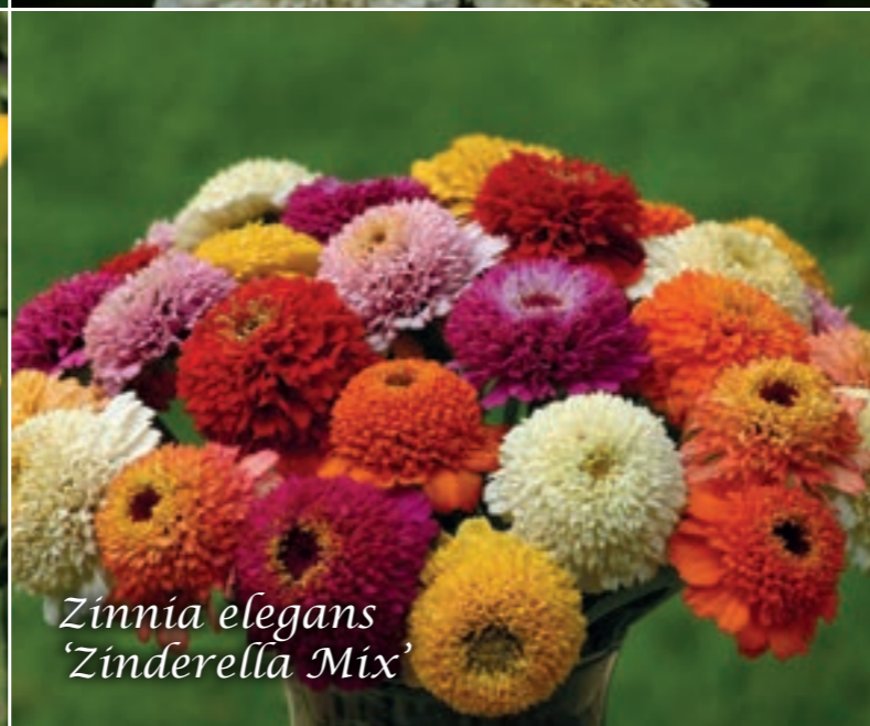
Zinnia elegans 'Zinderella Mix'