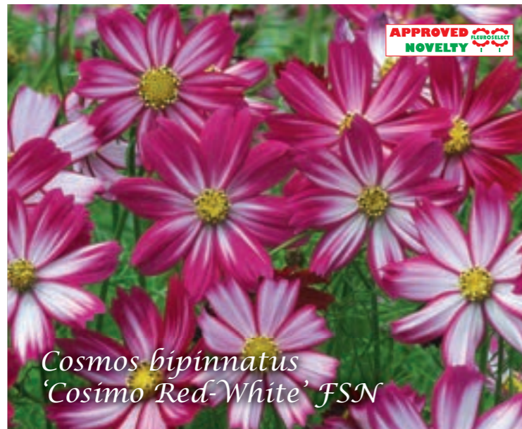
Cosmos bipinnatus 'Cosimo Red-White' FSN