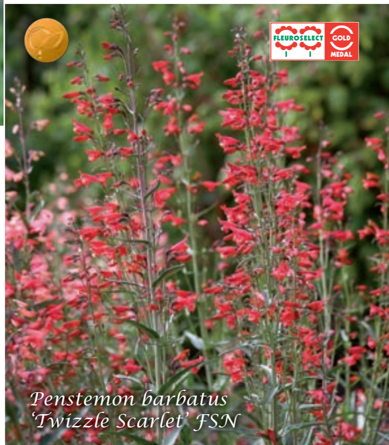
Penstemon barbatus 'Twizzle Scarlet' FSN

Papaver somniferum 'Lilac Pompom' Amazing laciniatum type in delicate lilac. Eye-catching: large frilly double flowers in a captivating new colour above blue-grey foliage.