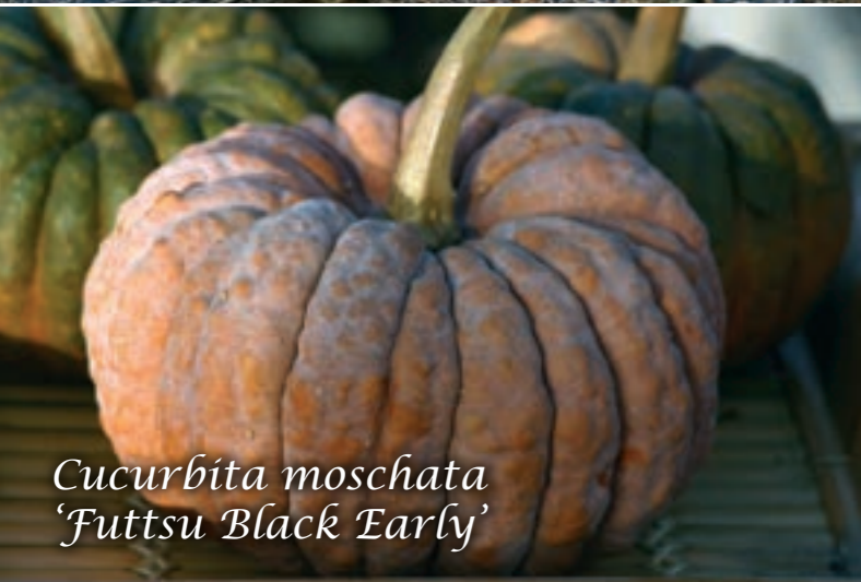
Cucurbita moschata 'Futtsu Black Early'

Type Annual Use Edible and decorative fruits Spread 80-140 cm / 32-55 in. Flowering season June - September, summer