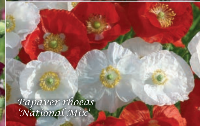
Papaver rhoeas 'National Mix'