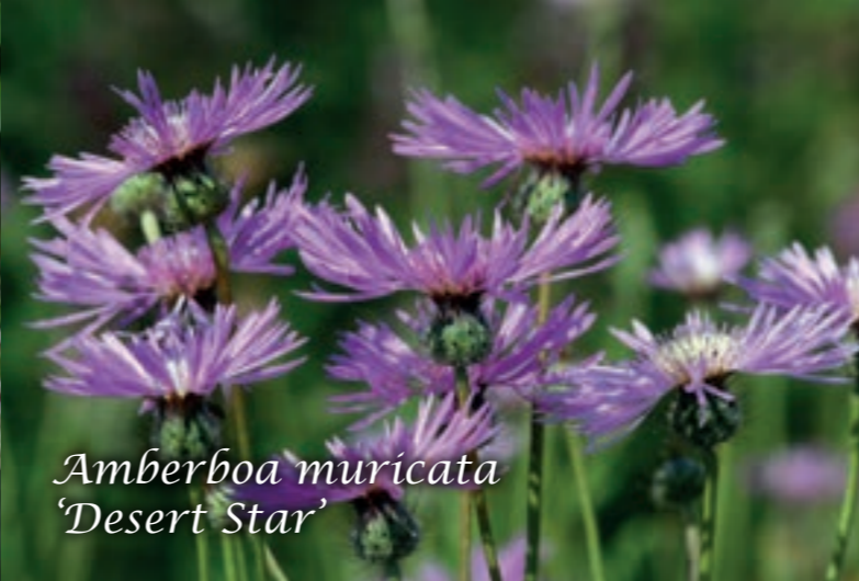
Amberboa muricata 'Desert Star'