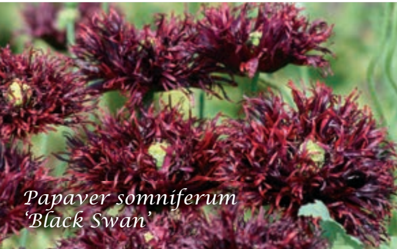
Papaver somniferum 'Black Swan'