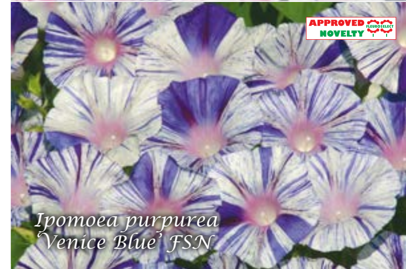
Ipomoea purpurea 'Venice Blue' FSN