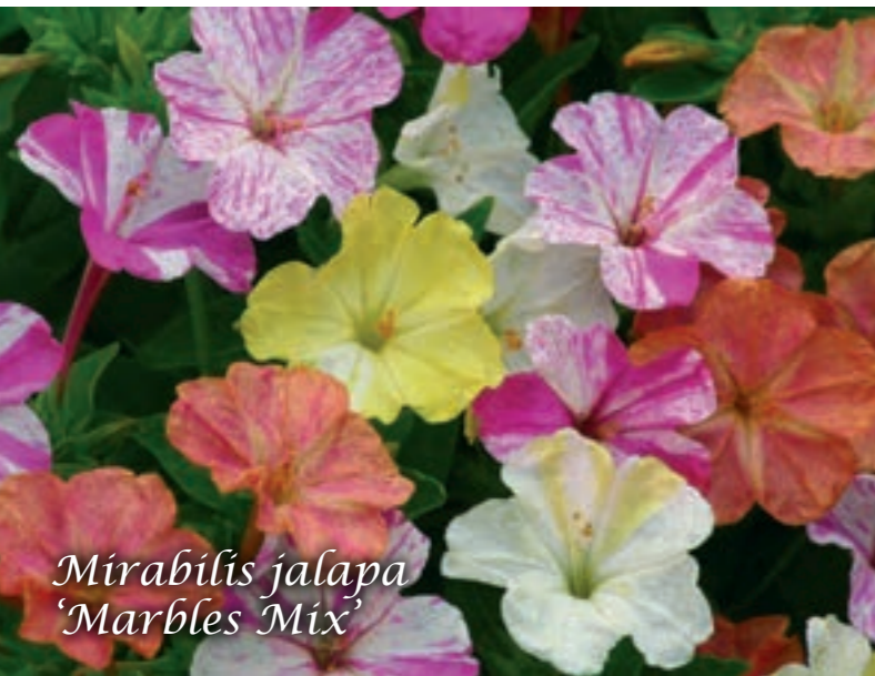
Mirabilis jalapa 'Marbles Mix'