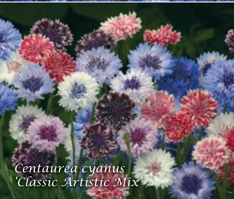
Centaurea cyanus 'Classic Artistic Mix'