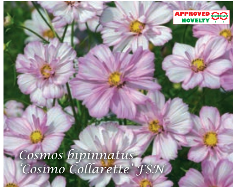
Cosmos bipinnatus 'Cosimo Collarette' FSN

Bicoloured flowers, striped in purple red and white.