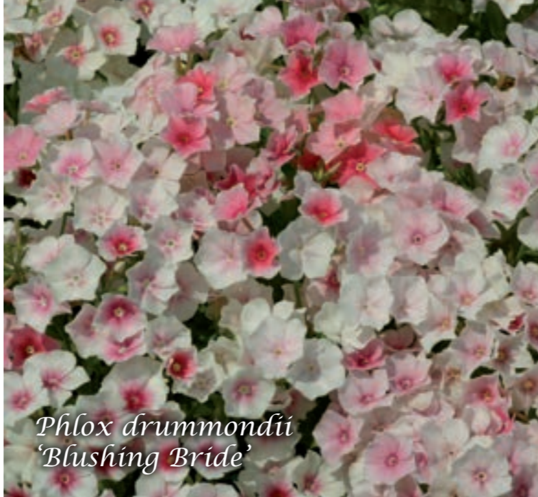
Phlox drummondii 'Blushing Bride'

Grandiflora Phlox with star shaped flowers in a striking colour pattern: blue with white stripes in the centre. Fleuroselect Novelty 2011.