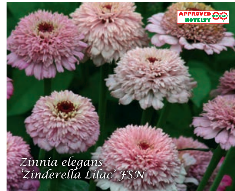
Zinnia elegans 'Zinderella Lilac' FSN