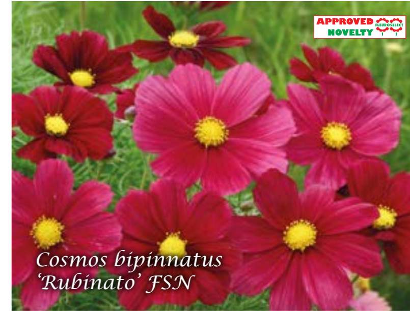
Cosmos bipinnatus 'Rubinato' FSN