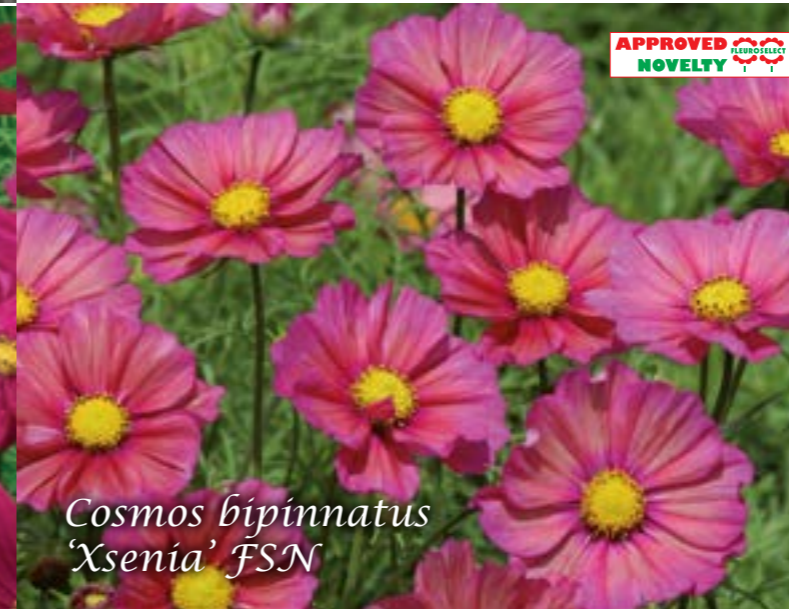
Cosmos bipinnatus 'Xsenia' FSN