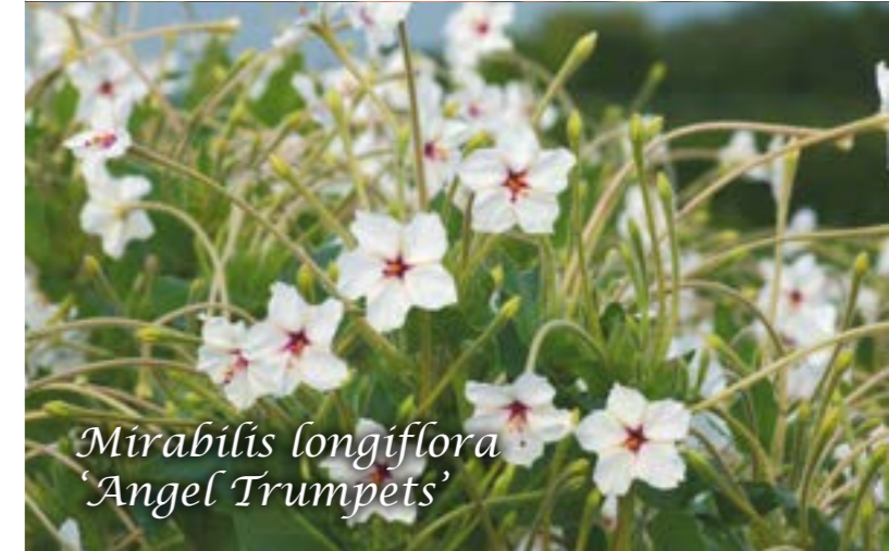
Mirabilis longiflora 'Angel Trumpets'