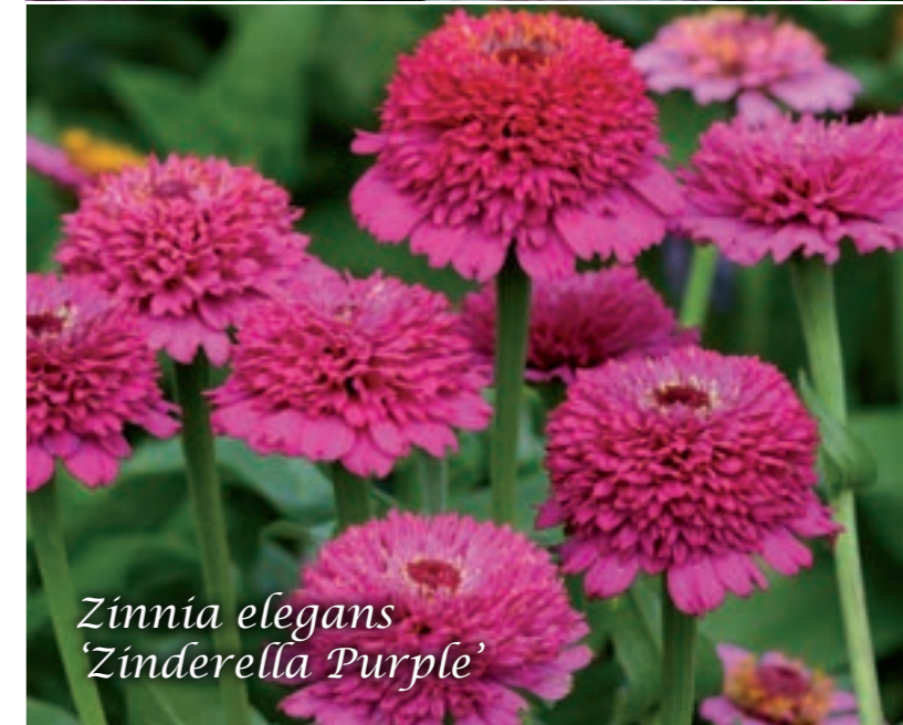
Zinnia elegans 'Zinderella Purple'