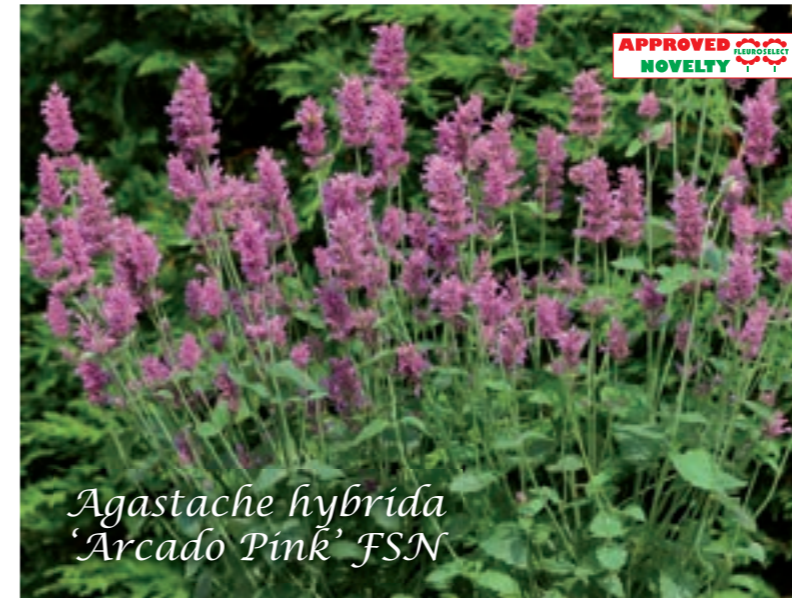
Agastache hybrida 'Arcado Pink' FSN

Type First-year-flowering tender perennial Use Border plant, landscaping, containers Height 50-60 cm / 20-25 in. Flowering season June - October, summer - late summer