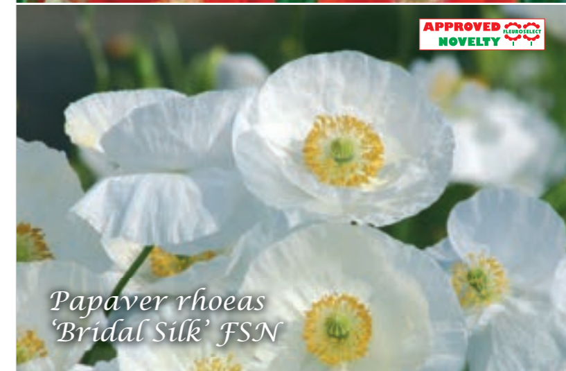
Papaver rhoeas 'Bridal Silk' FSN