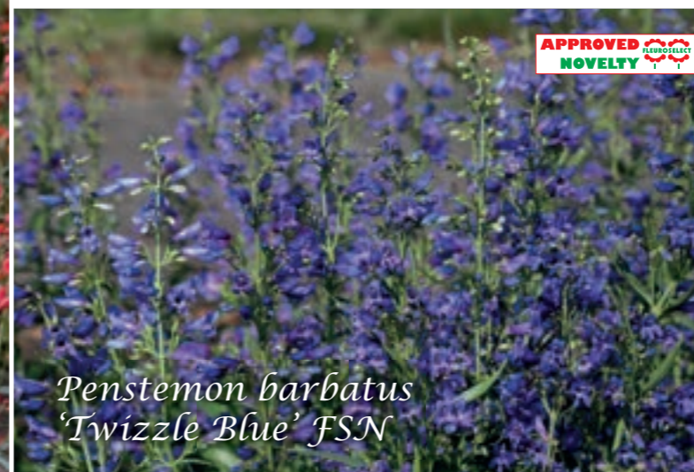
Penstemon barbatus 'Twizzle Blue' FSN