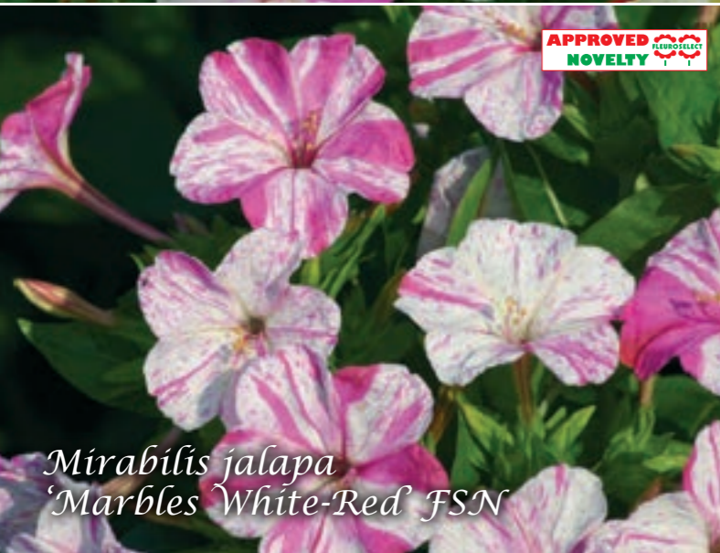
Mirabilis jalapa 'Marbles White-Red' FSN