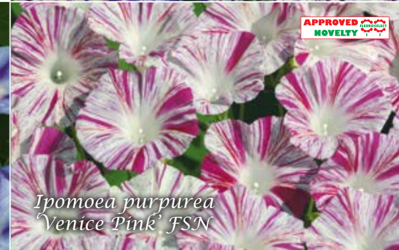
Ipomoea purpurea 'Venice Pink' FSN