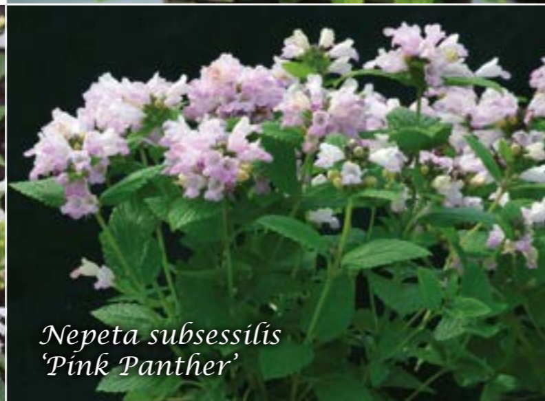
Nepeta subsessilis 'Pink Panther'