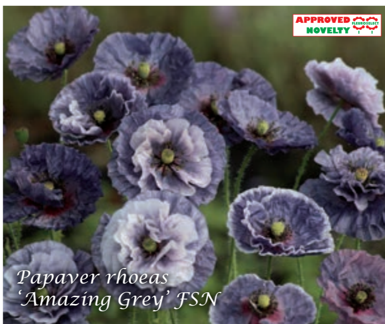
Papaver rhoeas 'Amazing Grey' FSN

With this new variety you will get poppies in various shades of grey in your garden: from silver grey to slate blue, sometimes with a red blush, and some flowers have a white edge. The single and ruffled half-double poppies create impressive grey clouds in the border, but every of these clouds has a silver lining. Fleuroselect Novelty 2018.