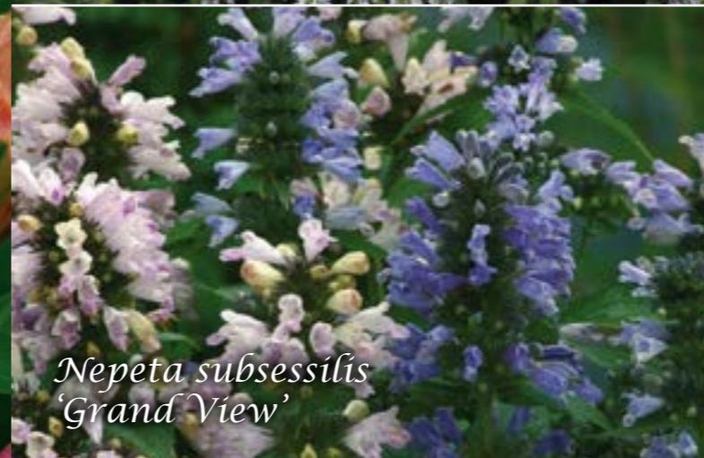
Nepeta subsessilis 'Grand View'