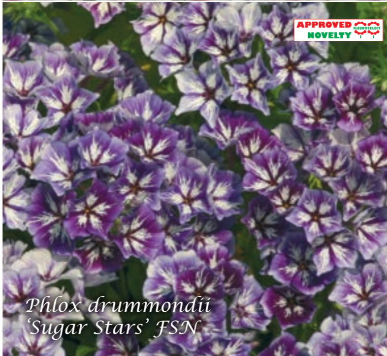
Phlox drummondii 'Sugar Stars' FSN