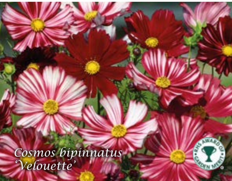
Cosmos bipinnatus 'Velouette'