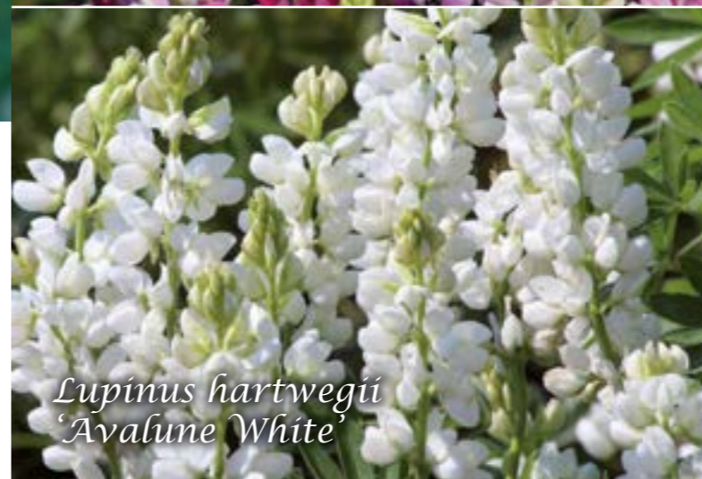
Lupinus hartwegii 'Avalune White'