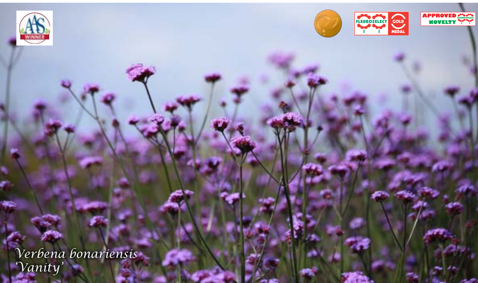
Verbena bonariensis 'Vanity'