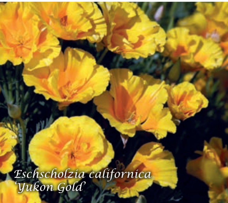
Eschscholzia californica 'Yukon Gold'