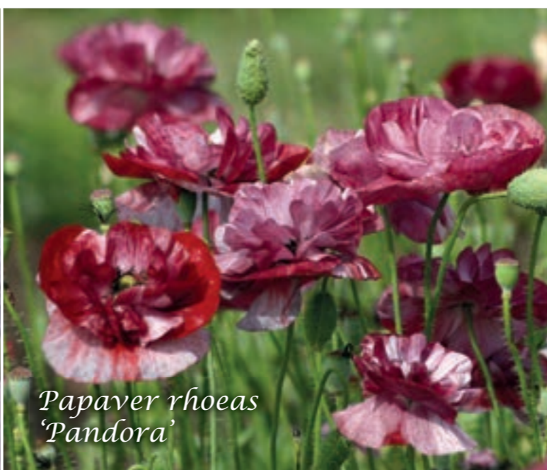
Papaver rhoeas 'Pandora'