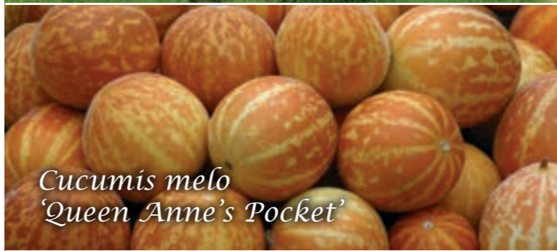
Cucumis melo 'Queen Anne's Pocket'

Pocket Melon, Fragrant Melon, Duft Melon, Melon de Poche. The fruits are very aromatic but not very sweet or tasteful. A long time ago ladies carried the small fruits in their pockets as a fragrance. Pick the small round and oval fruits when they are cream mottled green and let them mature inside. The green is turning to deep orange and the fruit have a delicate sweet fragrance. Shelf life is not very long. Best grown on a warm sheltered spot or in a glasshouse. Plant spread is 80-180 cm / 32-70 in.