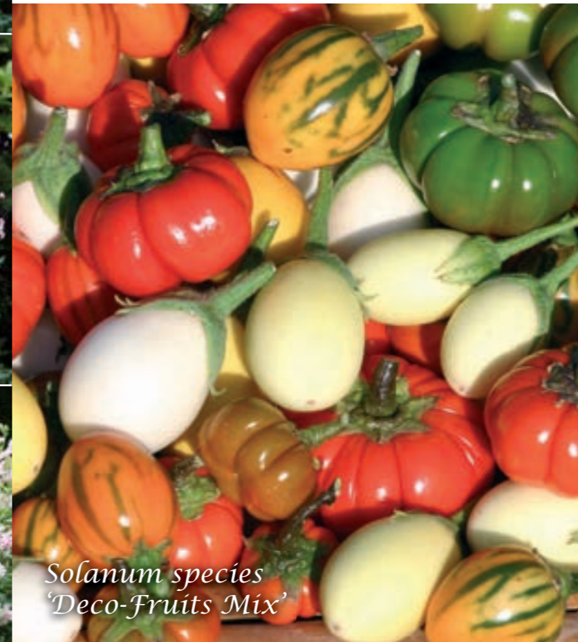
Solanum species 'Deco-Fruits Mix'

Type Annual Use Decorative fruits Flowering season June - September, summer. Harvest, late summer