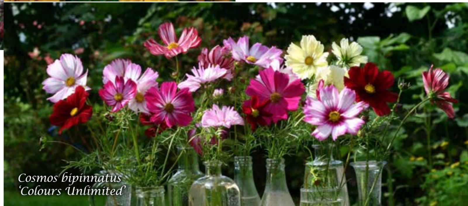
Cosmos bipinnatus 'Colours Unlimited'

Choice formula mixture including our top varieties - you won't find anything better anywhere else!