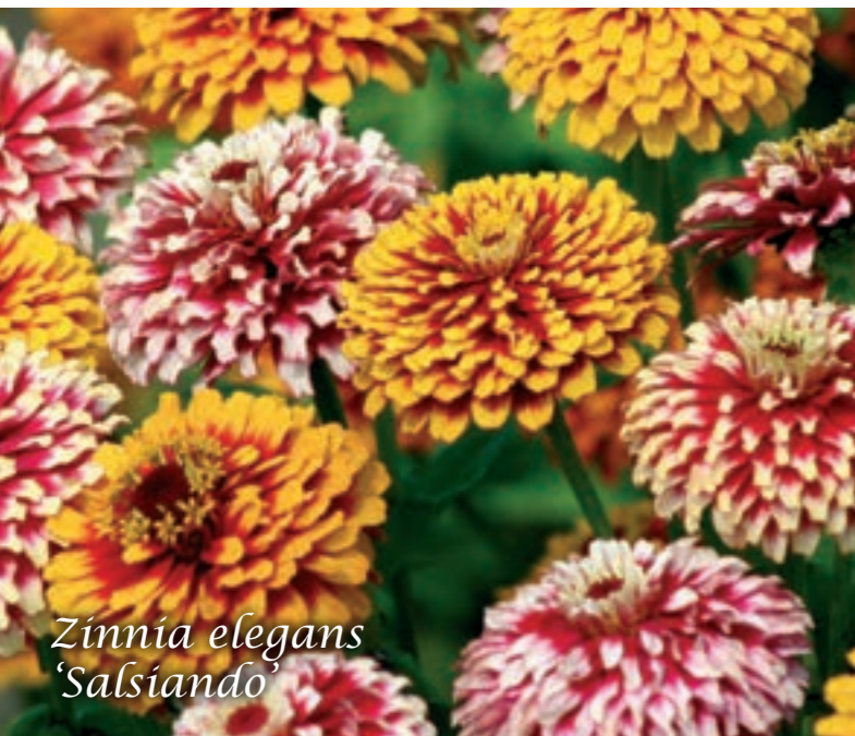
Zinnia elegans 'Salsiando'