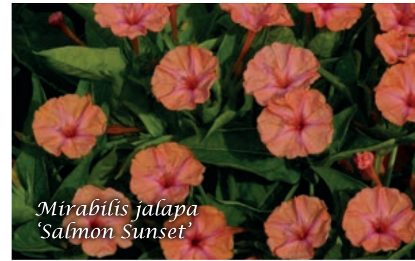
Mirabilis jalapa 'Salmon Sunset'