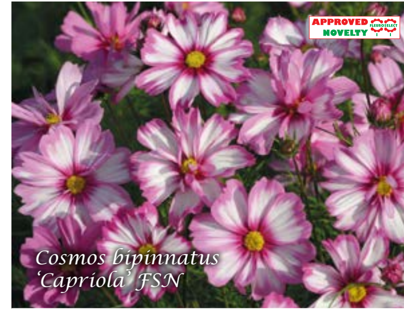
Cosmos bipinnatus 'Capriola' FSN

Another breakthrough Cosmos introduction with a new and remarkable colour: terracotta orange with rose edges. The tones change with the sunlight intensity. Compact well-branched plant and profuse bloomer for summer borders and the cutting garden. Fleuroselect Novelty 2018.