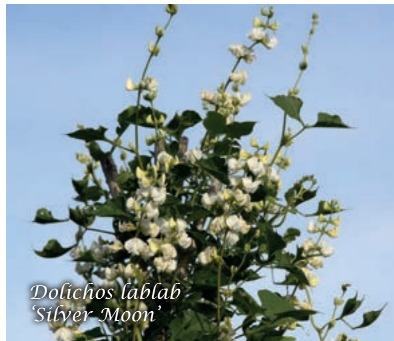
Dolichos lablab 'Silver Moon'