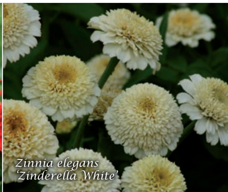
Zinnia elegans 'Zinderella White'