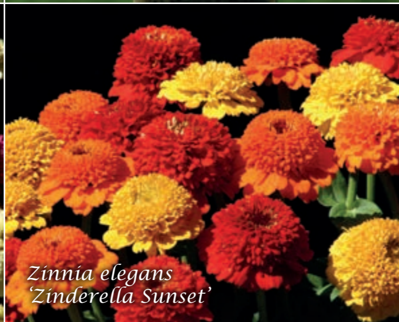
Zinnia elegans 'Zinderella Sunset'