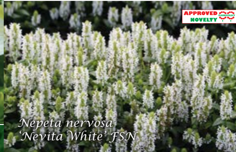
Nepeta nervosa 'Nevita White' FSN