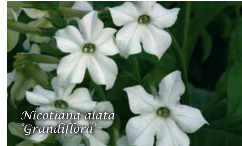
Nicotiana alata 'Grandiflora'

Well known Nicotiana for its unusual flowers. Airy plant with upright stems with chartreuse green flowers as small nodding bells. Beautiful and interesting addition to mixed borders as it cannot be compared to any other plant.