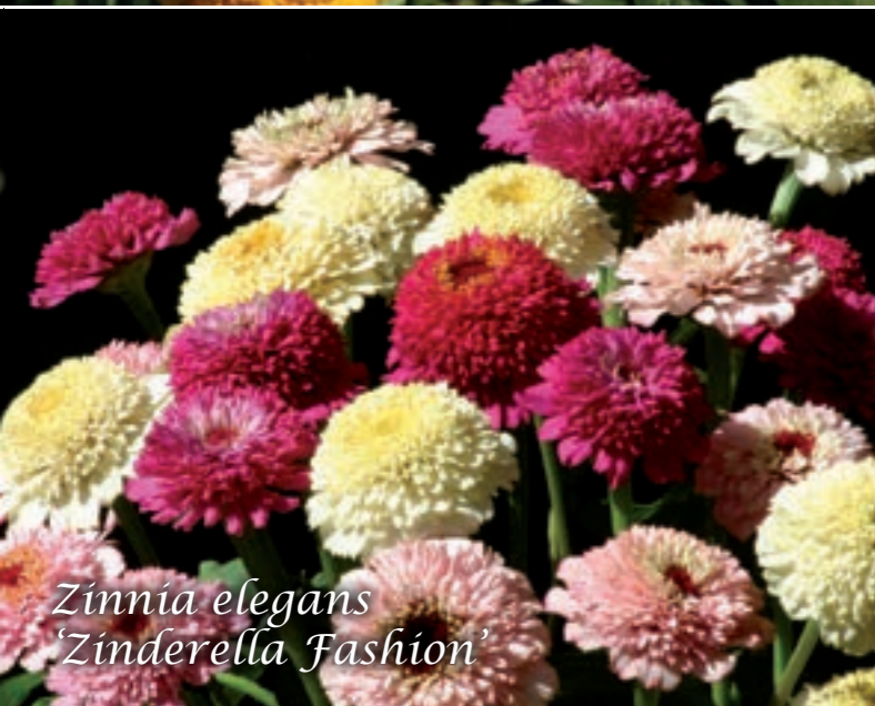
Zinnia elegans 'Zinderella Fashion'