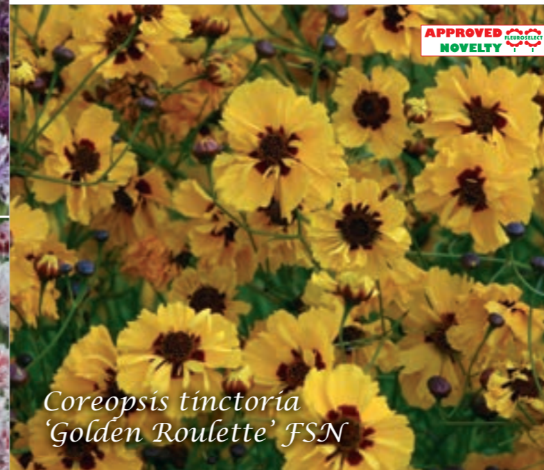
Coreopsis tinctoria 'Golden Roulette' FSN