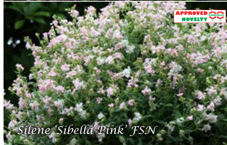
Silene 'Sibella Pink' FSN