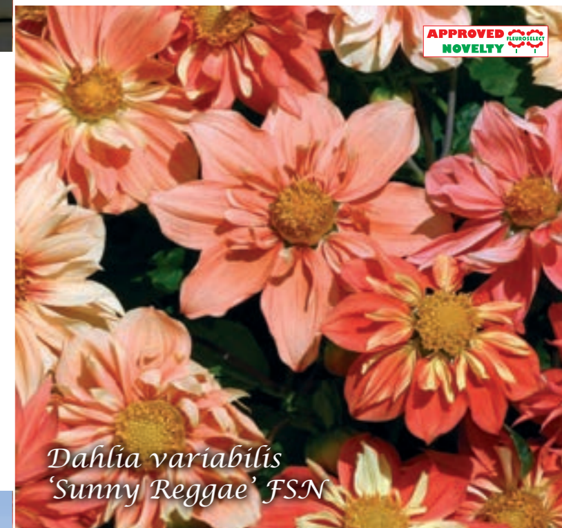
Dahlia variabilis 'Sunny Reggae' FSN

Type Annual Use Bedding plant, border plant, cut flower, containers Height 50-60 cm / 20-25 in. Flowering season July - October, summer - late summer