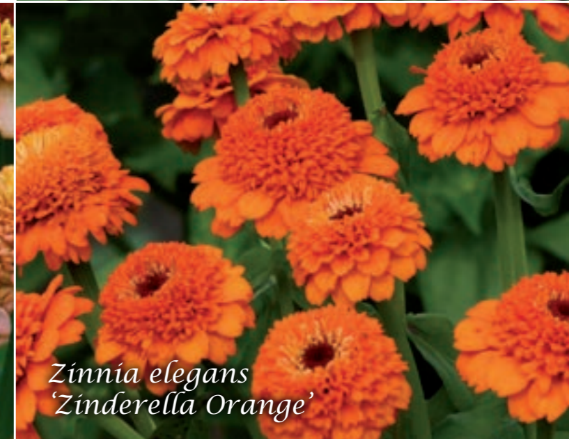
Zinnia elegans 'Zinderella Orange'