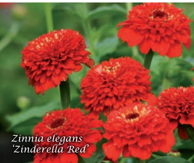
Zinnia elegans 'Zinderella Red'