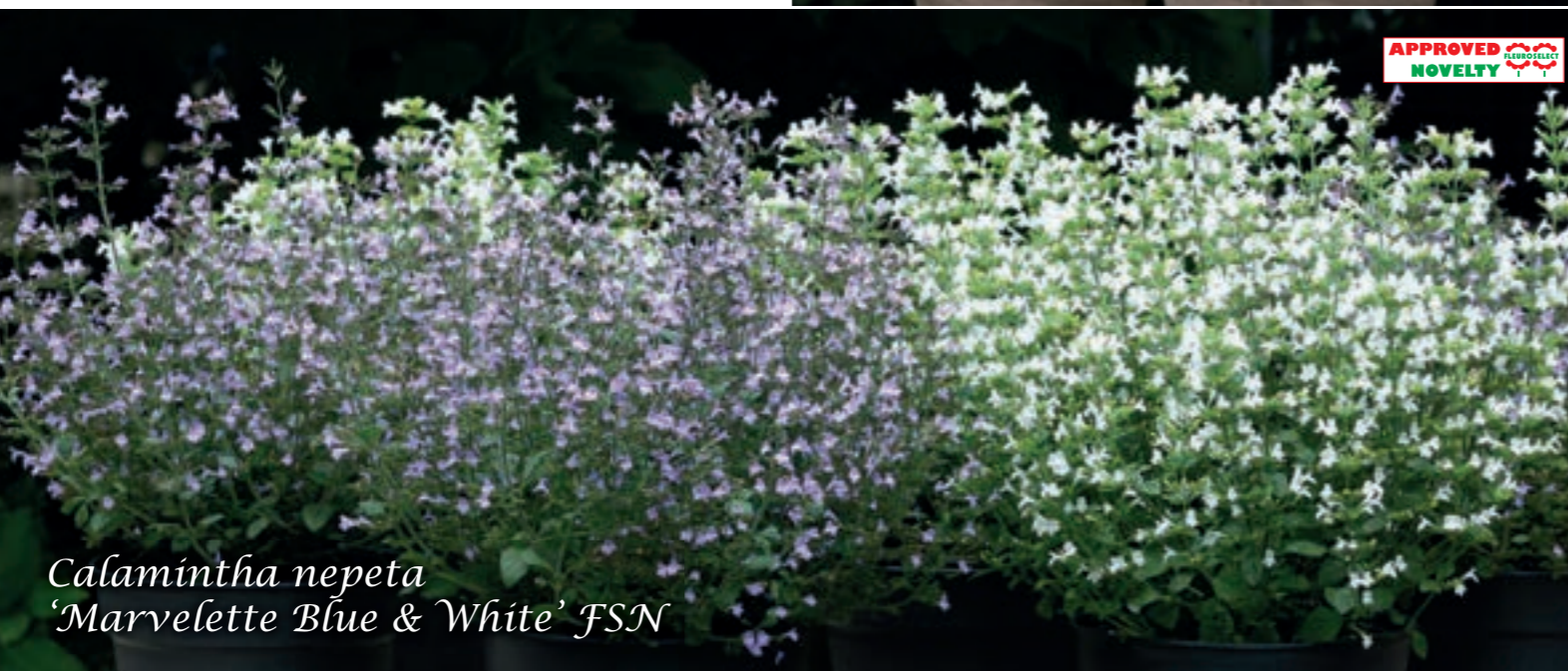
Calamintha nepeta 'Marvelette Blue & White' FSN