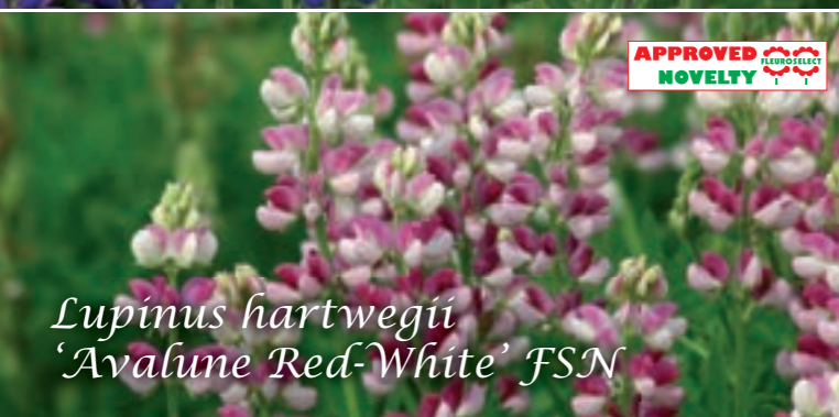
Lupinus hartwegii 'Avalune Red-White' FSN