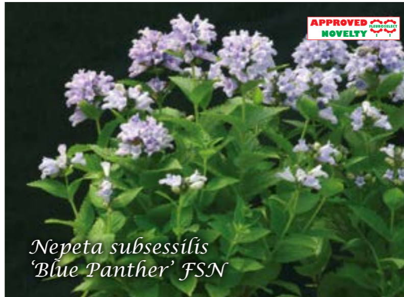
Nepeta subsessilis 'Blue Panther' FSN

Snow Panther is the first white Nepeta subsessilis and completes the Panther series. Fleuroselect Novelty 2021