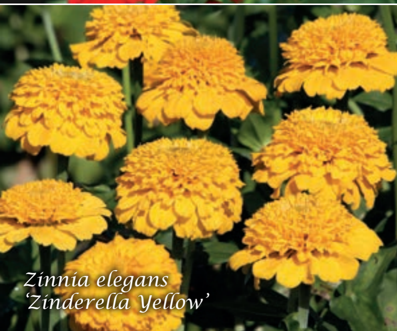
Zinnia elegans 'Zinderella Yellow'