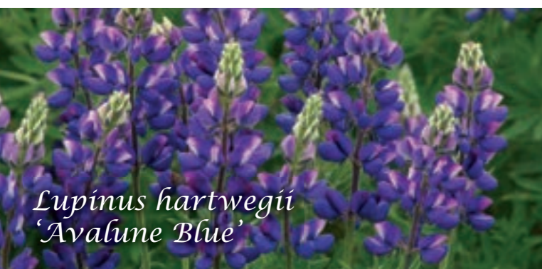
Lupinus hartwegii 'Avalune Blue'

Wonderful formula mixture of the full range of colours.