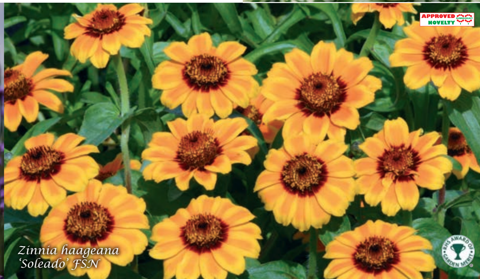
Zinnia haageana 'Soleado' FSN