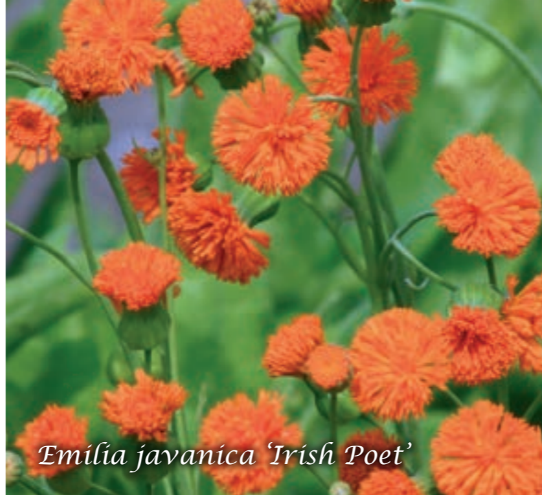
Emilia javanica 'Irish Poet'

Type Annual Use Bedding plant, border plant, landscaping Height 40-60 cm / 16-25 in. Flowering season June - September, summer