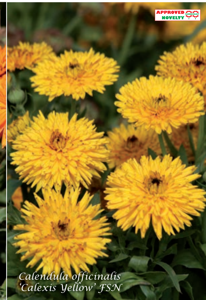
Calendula officinalis 'Calexis Yellow' FSN