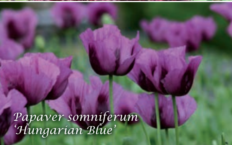
Papaver somniferum 'Hungarian Blue'

Papaver somniferum 'Lilac Pompom' Amazing laciniatum type in delicate lilac. Eye-catching: large frilly double flowers in a captivating new colour above blue-grey foliage.