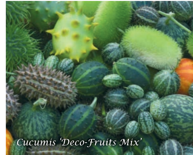
Cucumis 'Deco-Fruits Mix'

The elongated, slightly oval shaped fruits are about 6 cm / 2.5 in. long. Brown with contrasting light brown stripes and spikes. The fruits of this species are quite distinctive and therefore very useful in combination with other species.