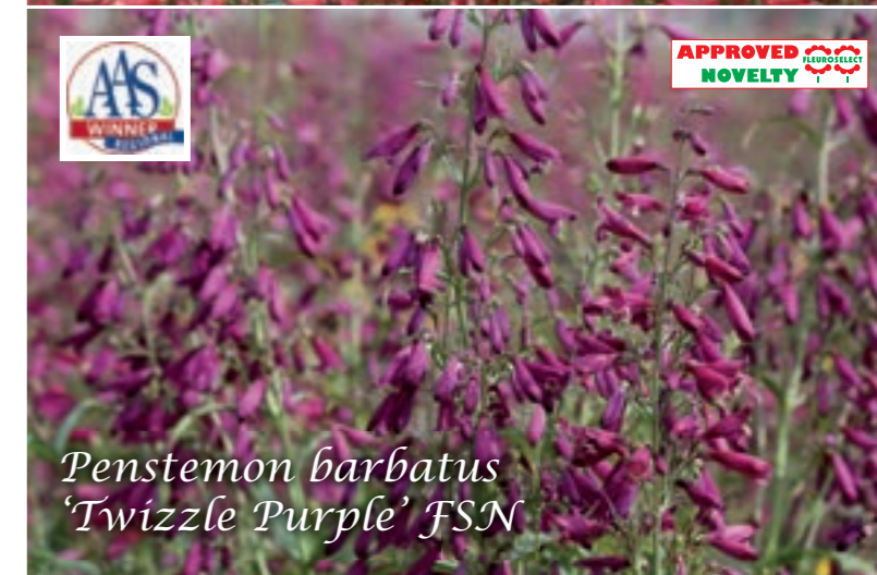
Penstemon barbatus 'Twizzle Purple' FSN