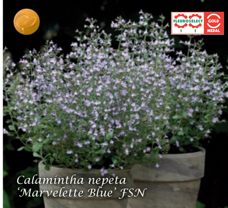
Calamintha nepeta 'Marvelette Blue' FSN

Clear white flowers. Fleuroselect Novelty 2015.