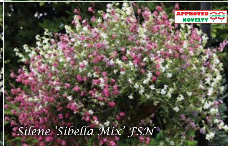
Silene 'Sibella Mix' FSN