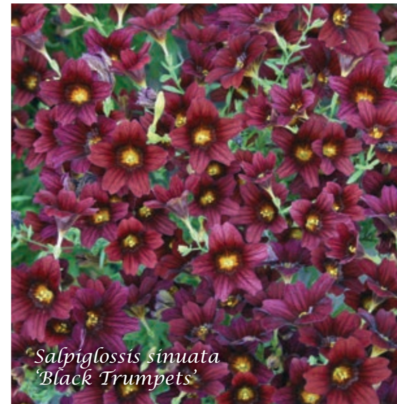
Salpiglossis sinuata 'Black Trumpets'

Type Annual Use Bedding, border plant Height 40-50 cm / 15-20 in. Flowering season July - September, summer