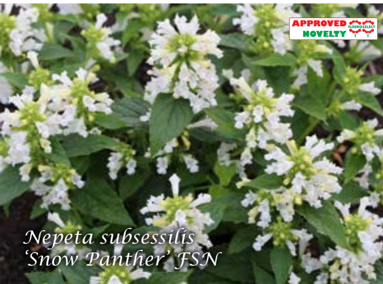
Nepeta subsessilis 'Snow Panther' FSN