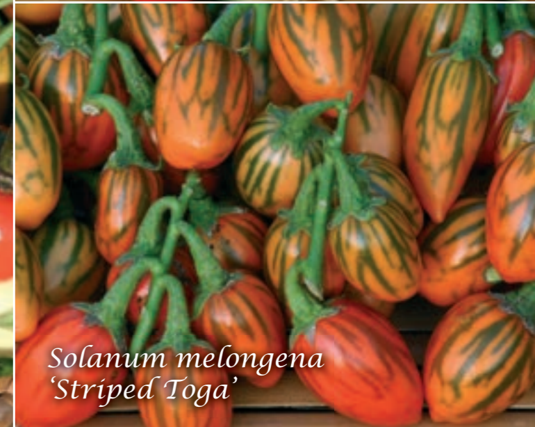
Solanum melongena 'Striped Toga'