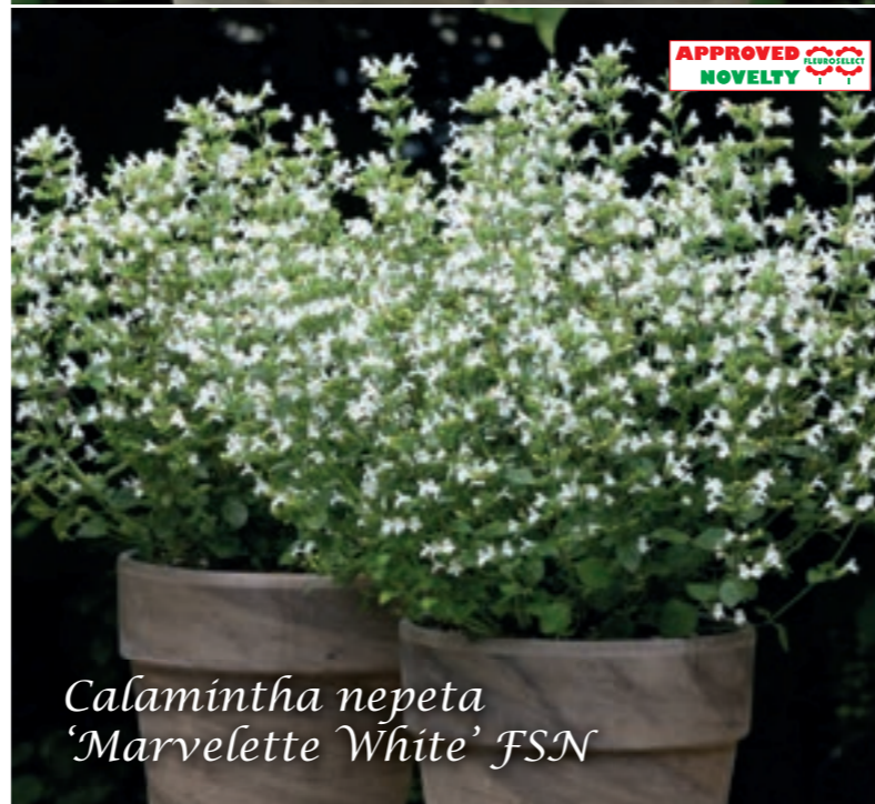
Calamintha nepeta 'Marvelette White' FSN