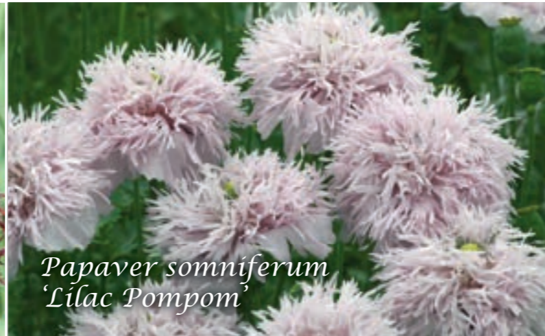
Papaver somniferum 'Lilac Pompom'