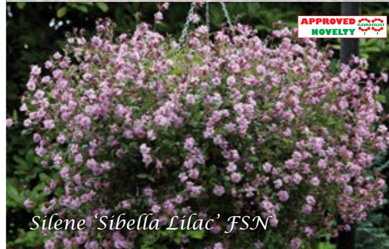
Silene 'Sibella Lilac' FSN