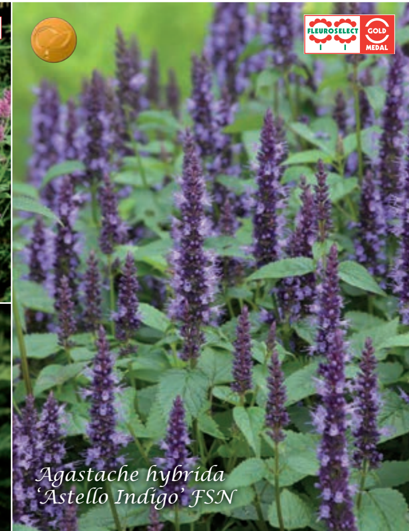
Agastache hybrida 'Astello Indigo' FSN

Van Hemert & Co. B.V. Schotlandlaan 16 2391 PP Hazerswoude - Dorp Holland