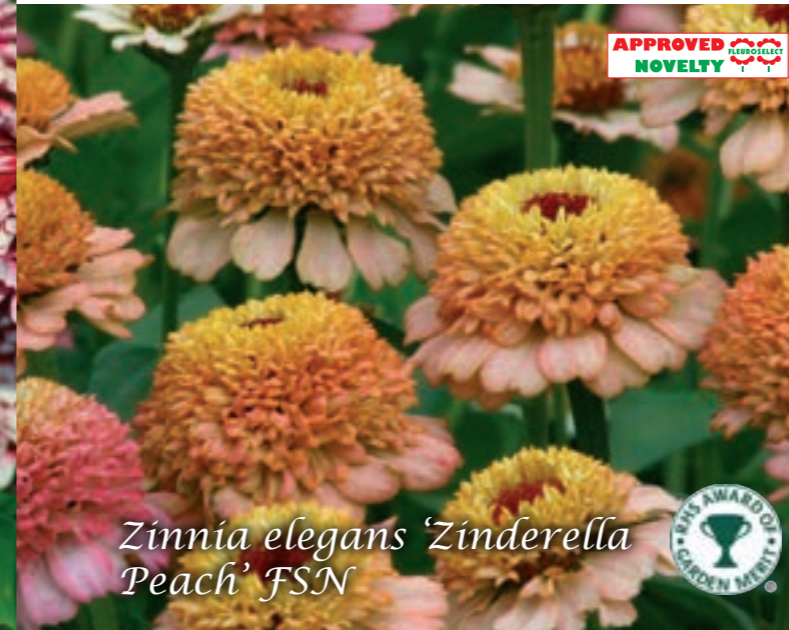
Zinnia elegans 'Zinderella 'Peach' FSN