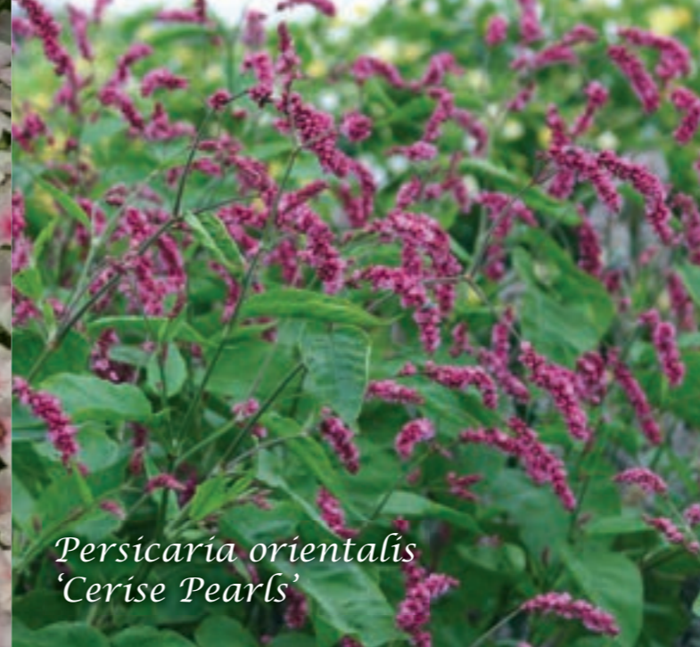
Persicaria orientalis 'Cerise Pearls'