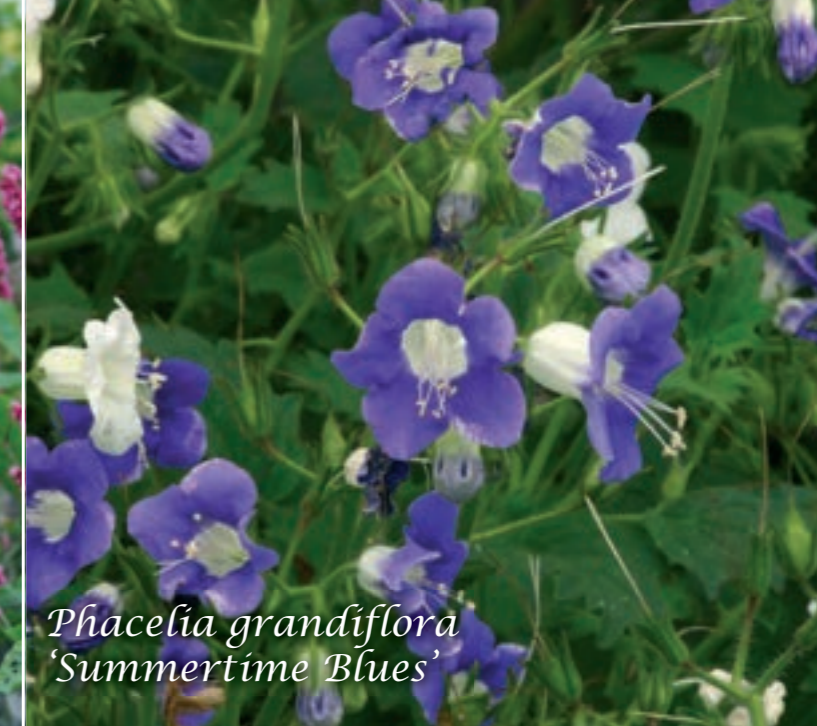
Phacelia grandiflora 'Summertime Blues'