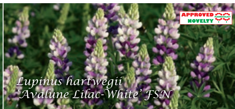
Lupinus hartwegii 'Avalune Lilac-White' FSN