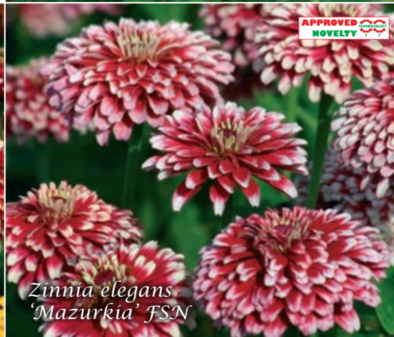
Zinnia elegans 'Mazurkia' FSN