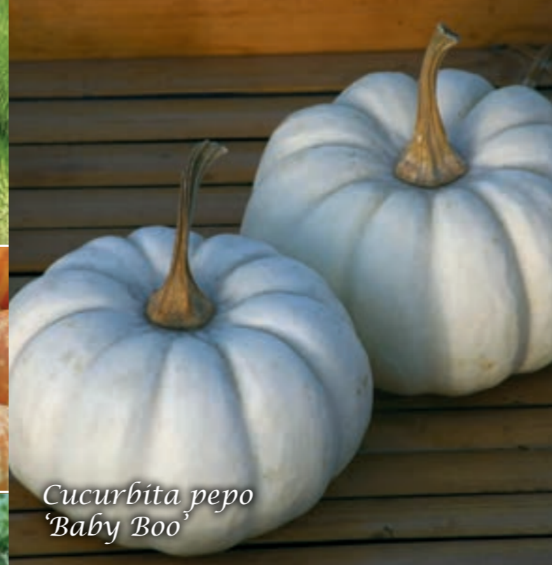
Cucurbita pepo 'Baby Boo'