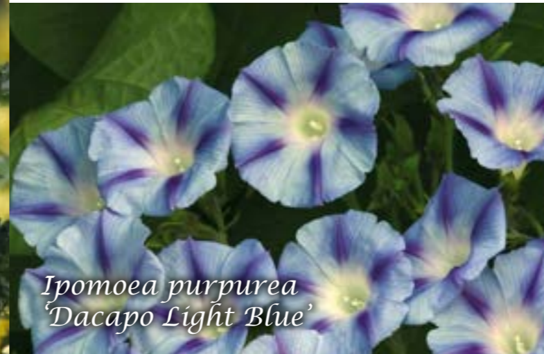
Ipomoea purpurea 'Dacapo Light Blue'