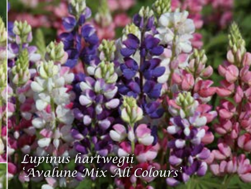
Lupinus hartwegii 'Avalune Mix All Colours'