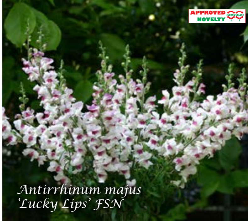
Antirrhinum majus 'Lucky Lips' FSN

Type Hardy annual Use bedding, border and cut flower Height 50-70 cm / 20-28 in. Flowering season July - September, summer - late summer