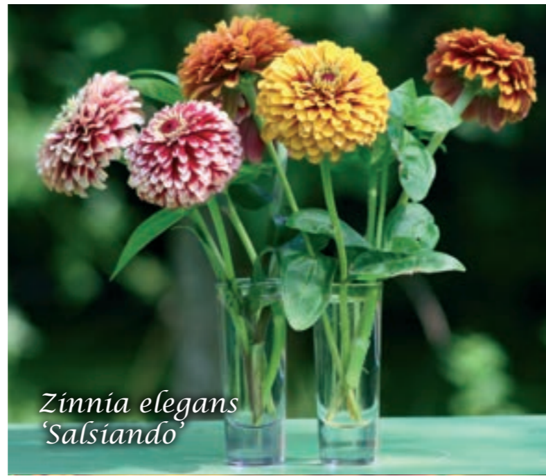
Zinnia elegans 'Salsiando'

Superb mixture of both Macarenia and Mazurkia. Exceptional quality in bicour Zinnias.