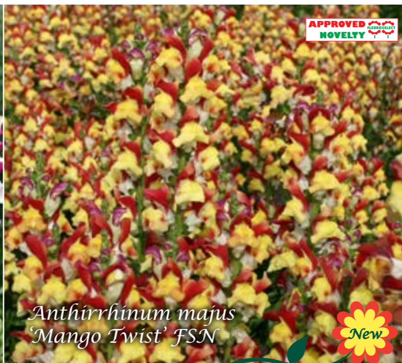
Antirrhinum majus 'Mango Twist' FSN