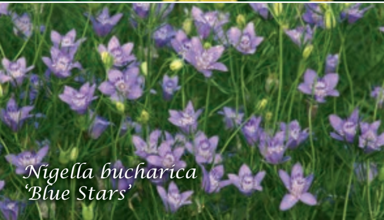
Nigella bucharica 'Blue Stars'

Type Annual Use Bedding plant, border plant, pot plant Height 20-30 cm / 8-12 in. Flowering season June - September, summer