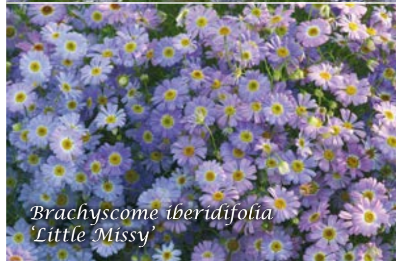
Brachyscome iberidifolia 'Little Missy'

Type Annual Use Bedding, border plant Height 15-30 cm / 6-12 in. Flowering season July - September, summer