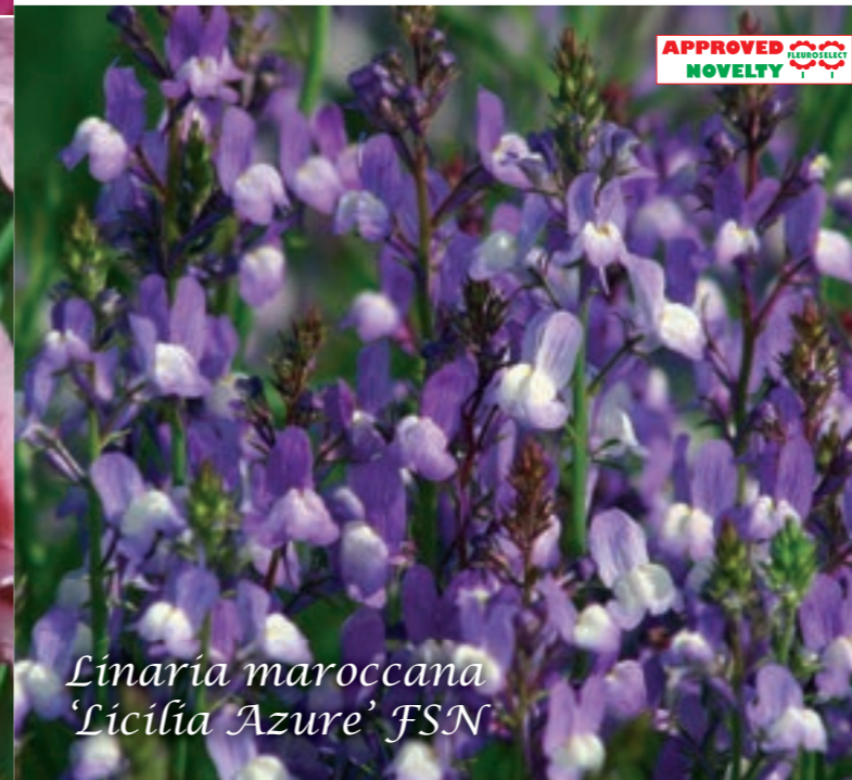
Linaria maroccana 'Licilia Azure' FSN

Deep violet blue with a bright yellow throat.