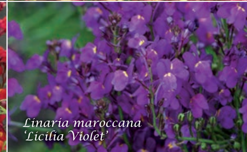
Linaria maroccana 'Licilia Violet'