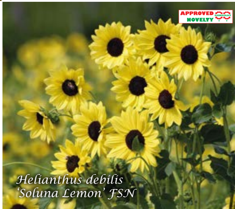
Helianthus debilis 'Soluna Lemon' FSN

Type Annual Use Cut flower, landscaping Height 100-120 cm / 40-45 in. Flowering season July - September, summer Seed count 180 seeds per gram