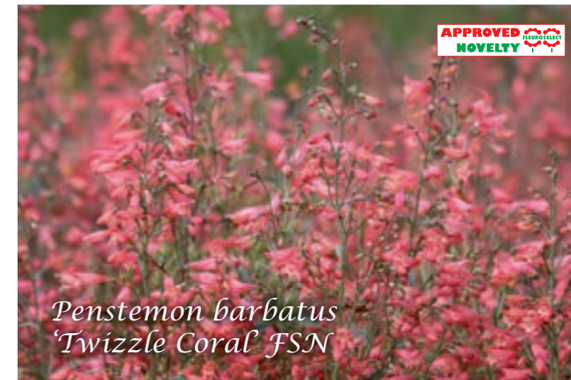
Penstemon barbatus 'Twizzle Coral' FSN

Stately plants with creamy white flowers for contrast in the border. Fleuroselect Novelty 2020.