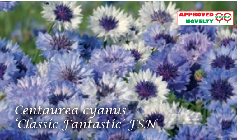
Centaurea cyanus 'Classic Fantastic' FSN