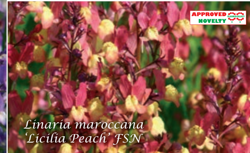
Linaria maroccana 'Licilia Peach' FSN