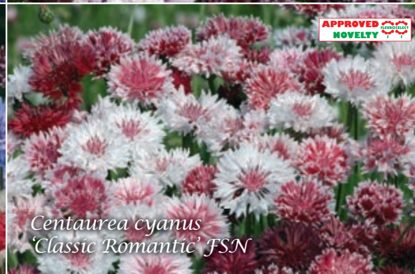
Centaurea cyanus 'Classic Romantic' FSN