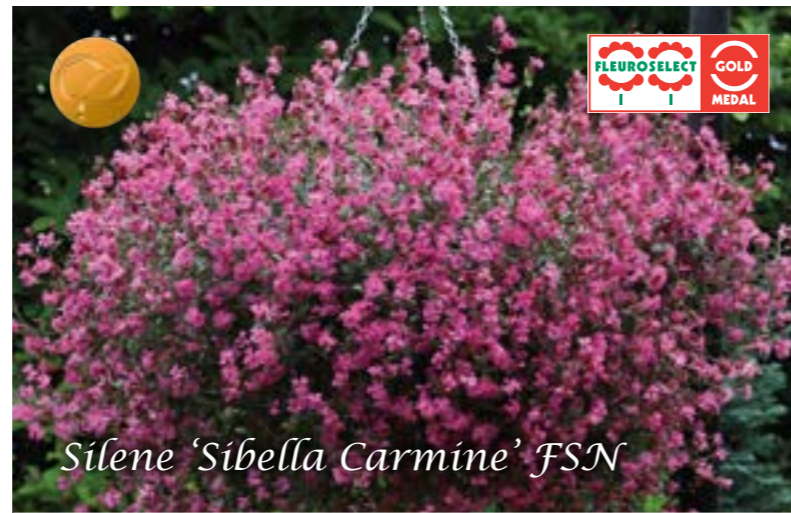
Silene 'Sibella Carmine' FSN

When started from a spring sowing Sibella can be used for bedding and baskets both for sunny and shady spots in the garden. With small trials you can find out the versatility of this new series and the opportunities it offers in the marketplace. There are four colours available: Carmine, Lilac, Pink and White. All varieties are Fleuroselect Novelties. Sibella Carmine is a Fleuroselect Gold Medal Winner for 2020.