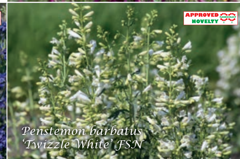
Penstemon barbatus 'Twizzle White' FSN