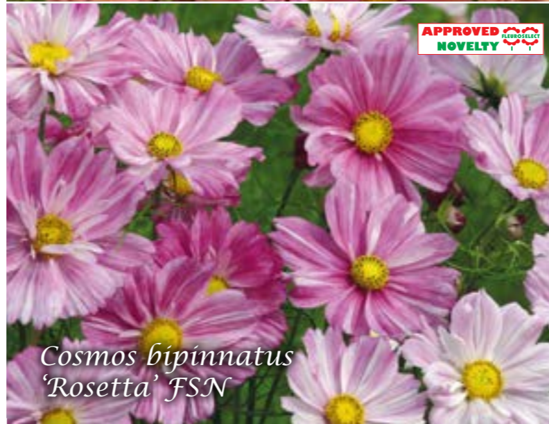
Cosmos bipinnatus 'Rosetta' FSN