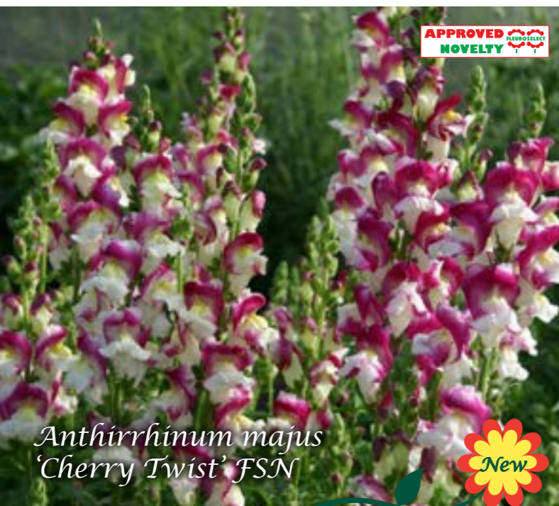
Antirrhinum majus 'Cherry Twist' FSN

Upper lips bright scarlet with mango-coloured lower lips