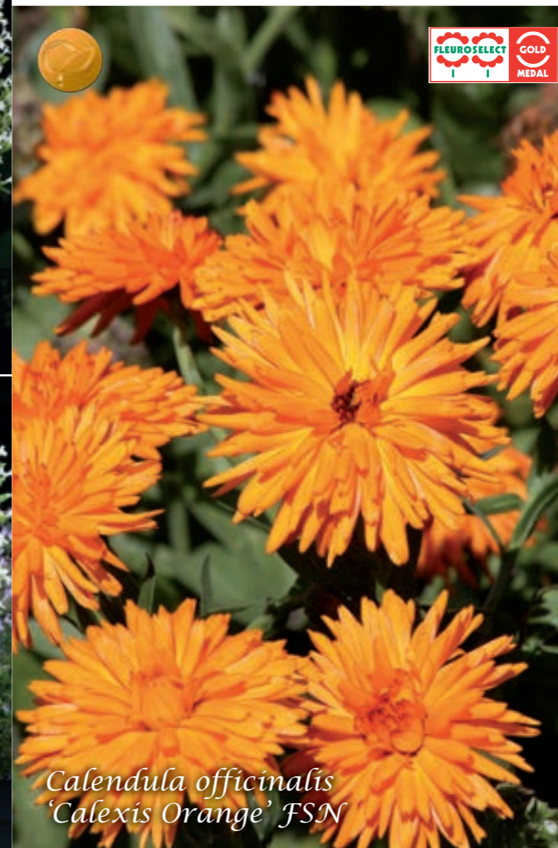
Calendula officinalis 'Calexis Orange' FSN

Fresh yellow cactus-flower with a dark brown centre. Fleuroselect Novelty 2018.