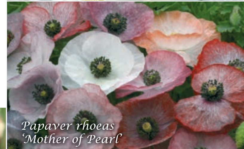
Papaver rhoeas 'Mother of Pearl'