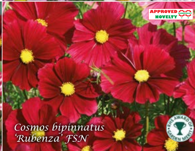
Cosmos bipinnatus 'Rubenza' FSN