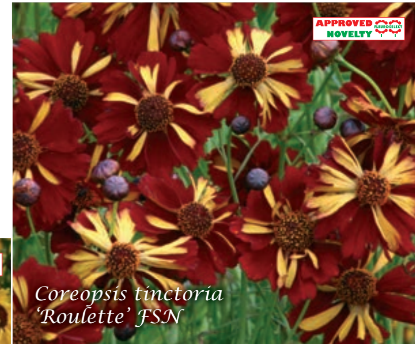
Coreopsis tinctoria 'Roulette' FSN

Roulette is an easy-to-grow annual for direct seeding with dark brown-red flowers. Each flower has a second row of golden brown petals which creates a special effect. Fleuroselect Novelty 2009.