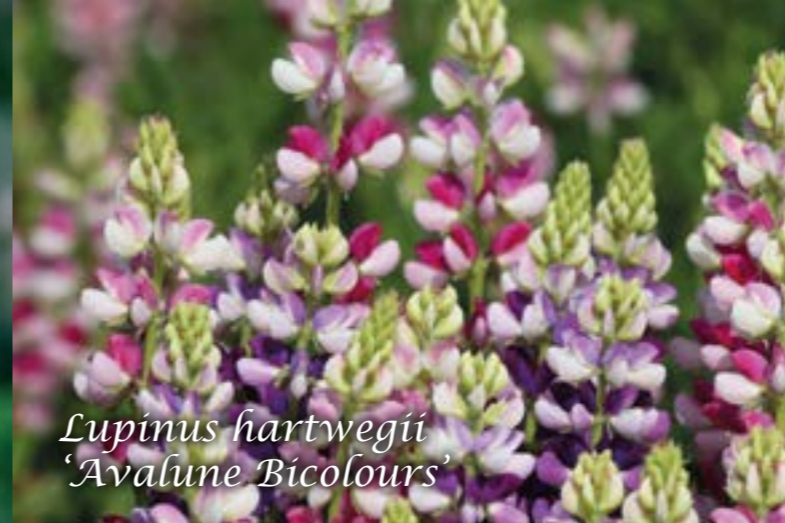
Lupinus hartwegii 'Avalune Bicolours'