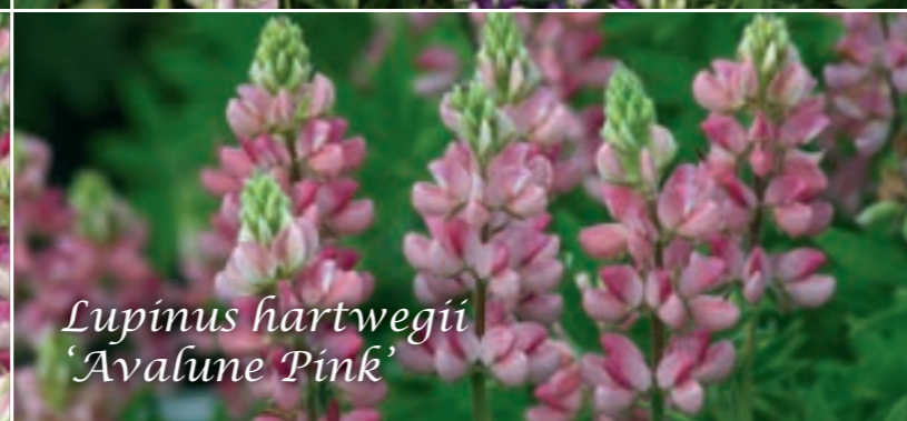
Lupinus hartwegii 'Avalune Pink'