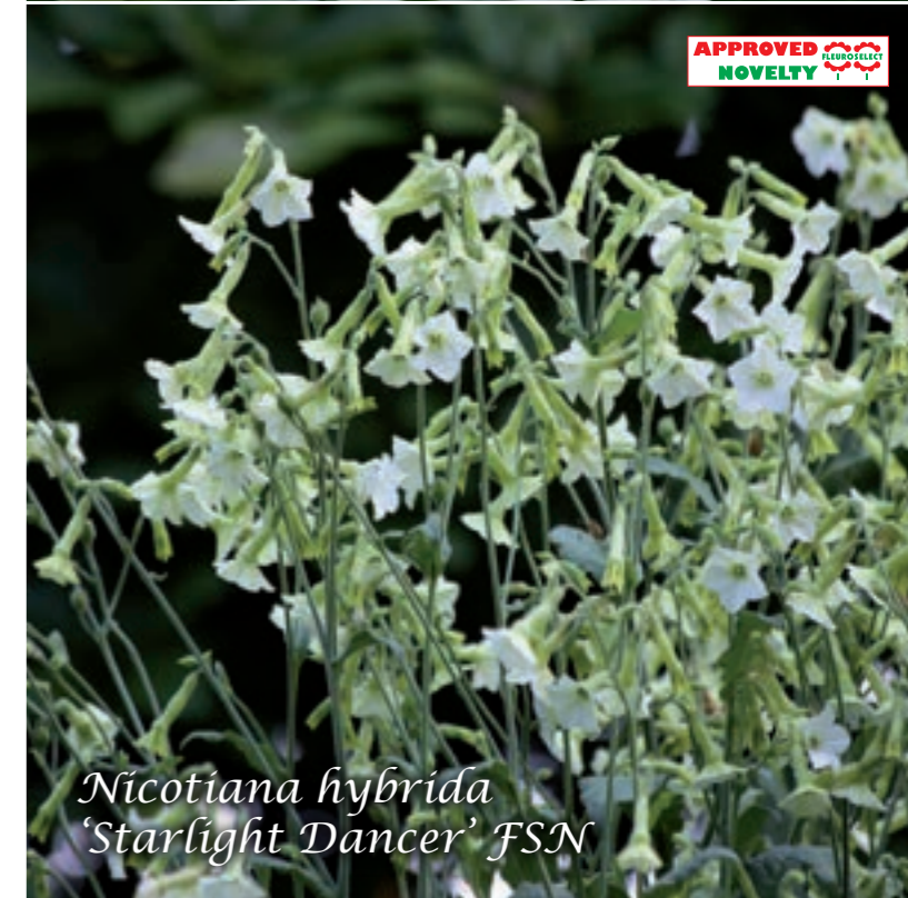
Nicotiana hybrida 'Starlight Dancer' FSN