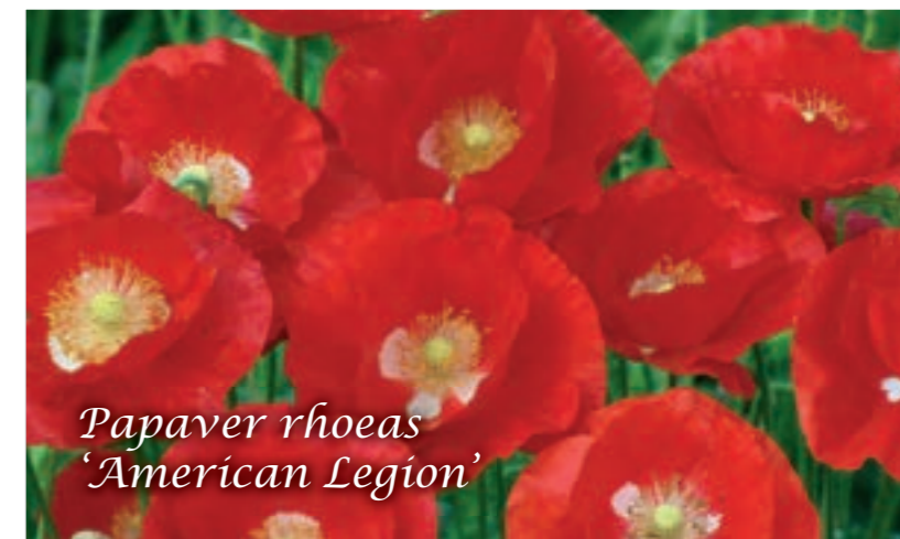
Papaver rhoeas 'American Legion'

Unique and truly impressive poppy. Pandora blooms in a phenomenal and surprising combination of shades, from the deepest burgundy red to pinkish-red all with silver-grey stripes on the lower petals. During the flowering season the colours change gradually.