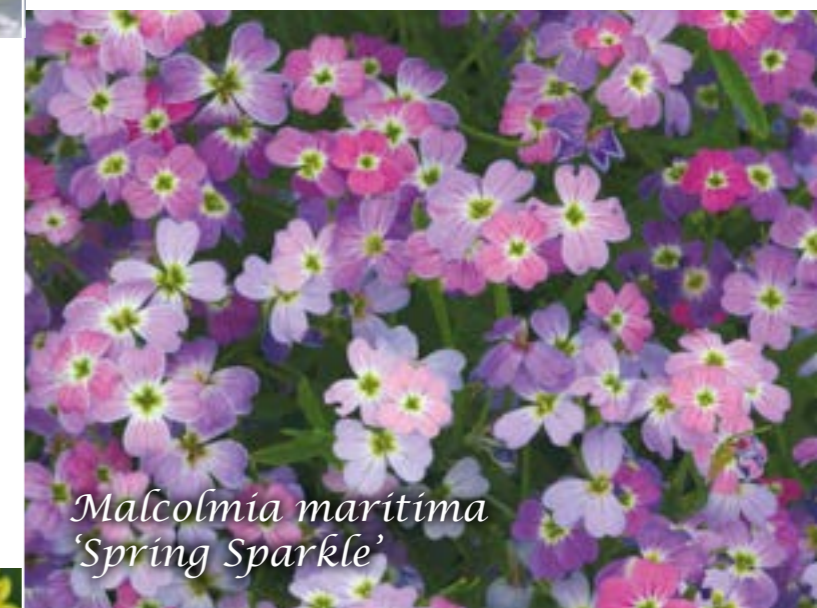
Malcolmia maritima 'Spring Sparkle'