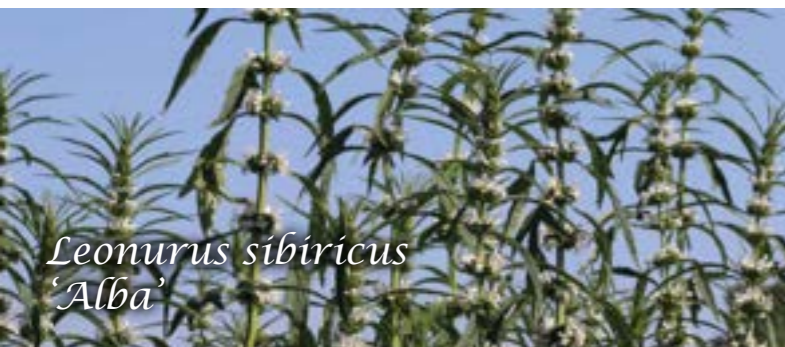
Leonurus sibiricus 'Alba'

Type Annual Use Border plant, cut flower, landscaping Height 150-180 cm / 60-70 in. Flowering season June - September, summer