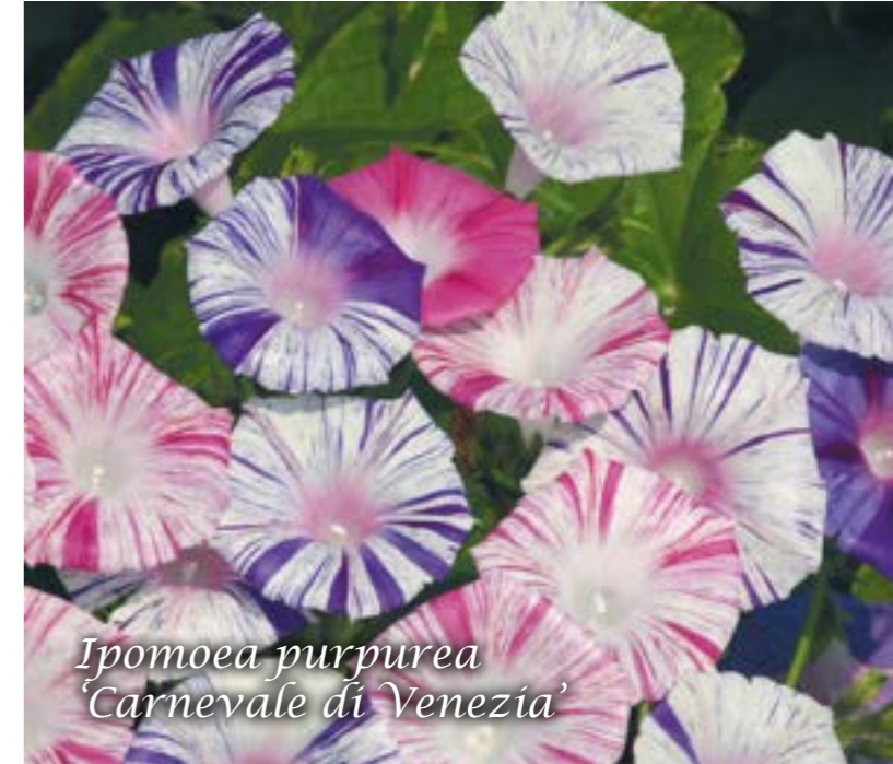
Ipomoea purpurea 'Carnevale di Venezia'

Eye-catching heavenly blue flowers with a darker purple-blue star. Outstanding colour in Ipomoea purpurea.