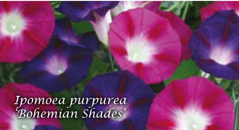
Ipomoea purpurea 'Bohemian Shades'

Mixture of dark violet and dark red shades.