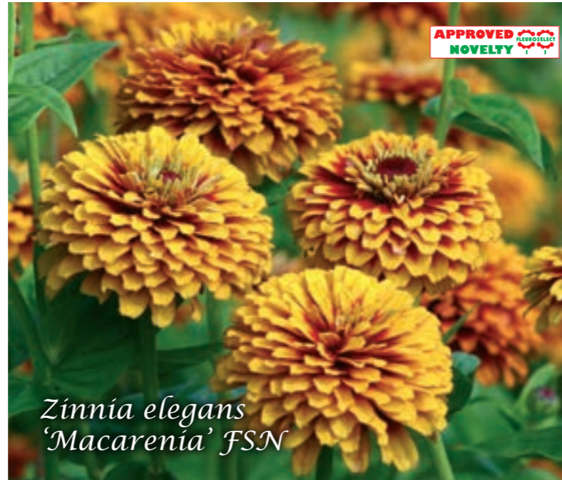
Zinnia elegans 'Macarenia' FSN