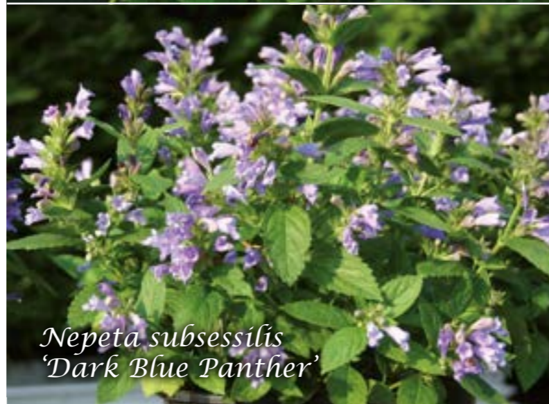
Nepeta subsessilis 'Dark Blue Panther'