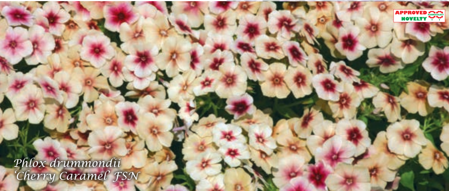
Phlox drummondii 'Cherry Caramel' FSN