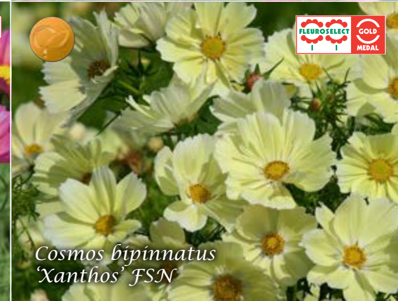
Cosmos bipinnatus 'Xanthos' FSN