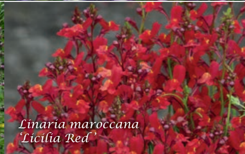
Linaria maroccana 'Licilia Red'