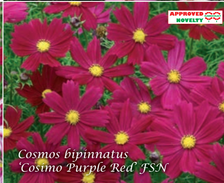
Cosmos bipinnatus 'Cosimo Purple Red' FSN