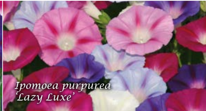
Ipomoea purpurea 'Lazy Luxe'

Luxurious formula mixture of 10 sparkling colours. Lazy Luxe displays each morning many different colours from clear white to violet and rosy-red.