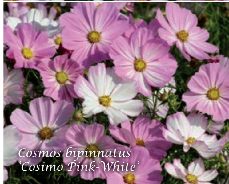
Cosmos bipinnatus 'Cosimo Pink-White'