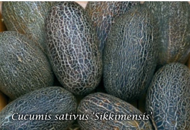
Cucumis sativus 'Sikkimensis'