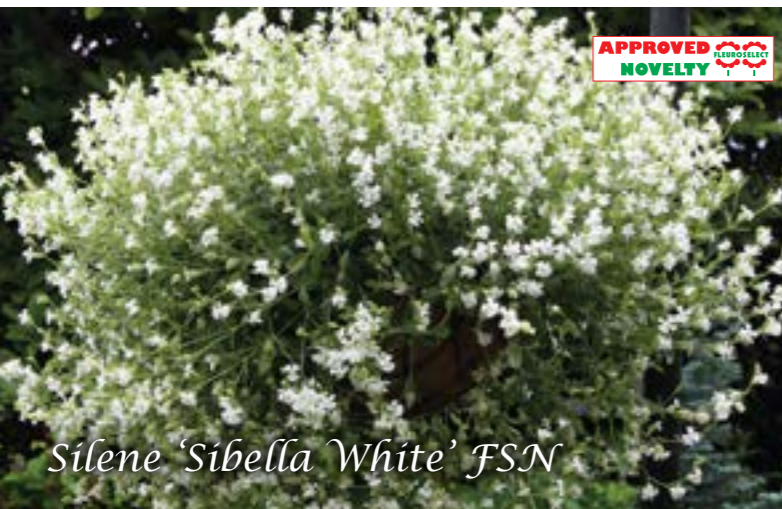
Silene 'Sibella White' FSN