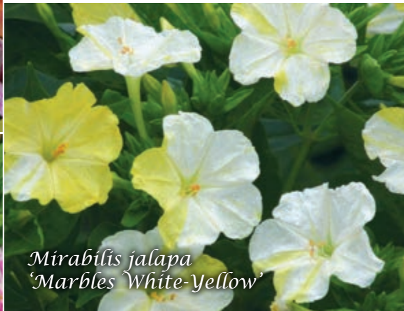
Mirabilis jalapa 'Marbles White-Yellow'

Pure white and soft yellow in each flower which create a beautiful luminosity in the evening.