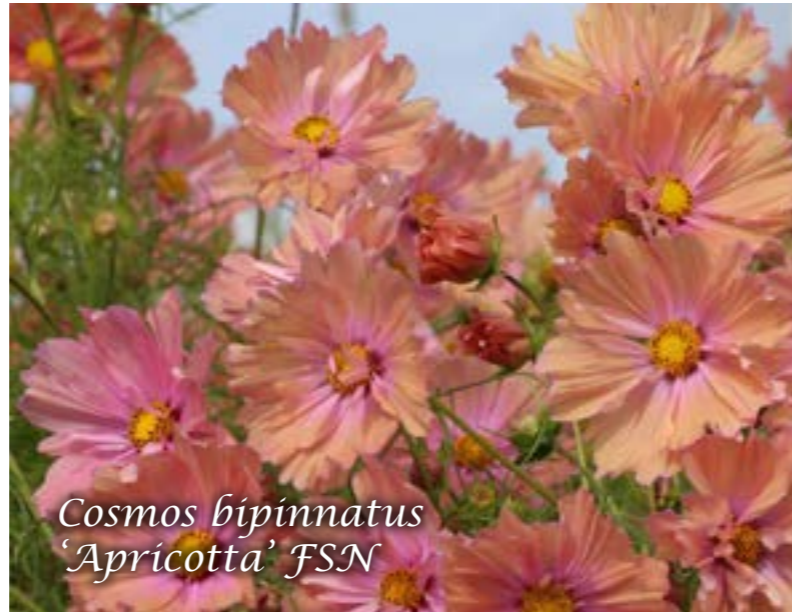
Cosmos bipinnatus 'Apricotta' FSN

Exceptional Cosmos variety with a unique contrasting colour pattern. The large flowers have the same dark red colour as Rubenza, but the petals have clear white stripes, and some flowers are white with a dark red picotee. Eye-catching color effect when planted in large groups.