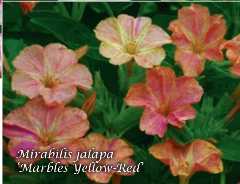
Mirabilis jalapa 'Marbles Yellow-Red'