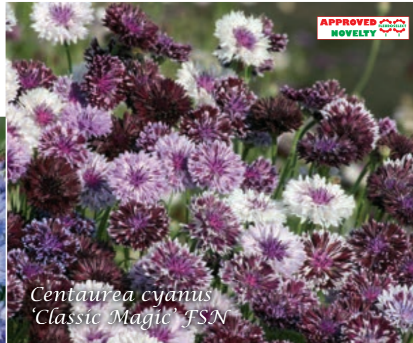
Centaurea cyanus 'Classic Magic' FSN