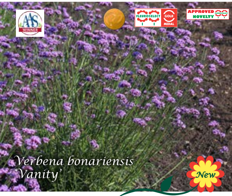
Verbena bonariensis 'Vanity'

Type first year flowering perennial Use border plant, landscaping, containers Height up to 80 cm / 31 in Flowering season June - October, summer - autumn